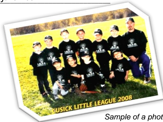
Sample of a photo to be submitted after sponsorship.