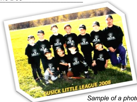
Sample of a photo to be submitted after sponsorship.